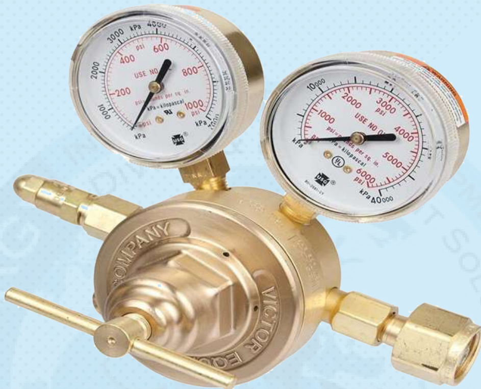
Victor 0781-1610 SR600-550-540 Oxygen Regulator